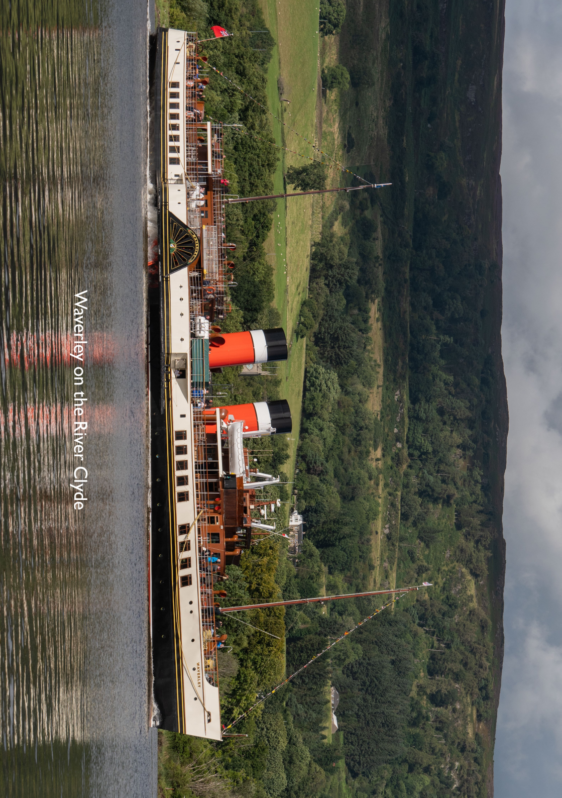
Waverley on the River Clyde