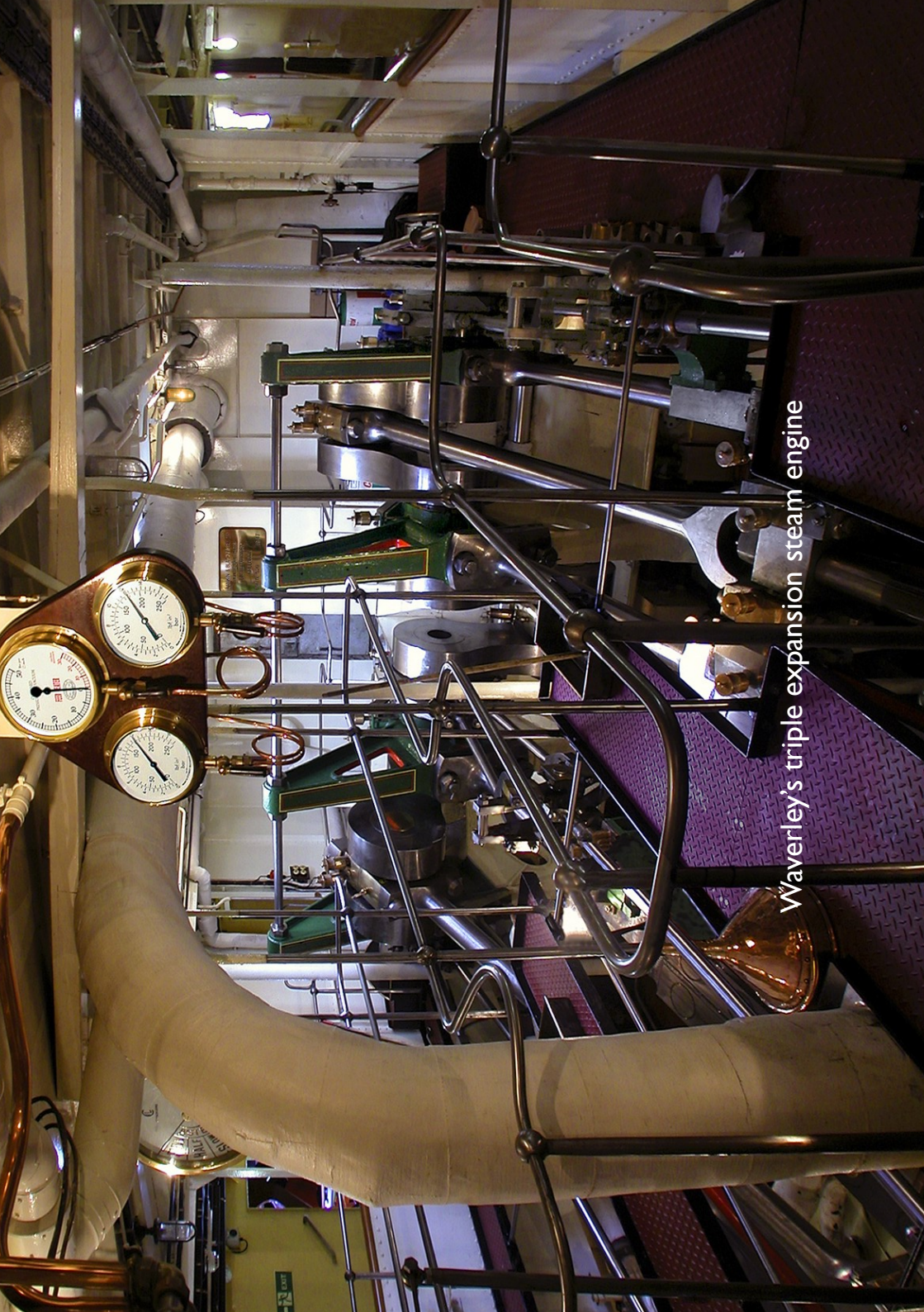
Waverley's triple expansion steam engine